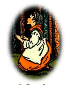
gretl Conference (and hansl, too!) Athens 2017

The bi-annual Gretl Conference is an inspiring opportunity to take stock of the current state of the gretl econometrics software project, including its embedded programming language hansl .